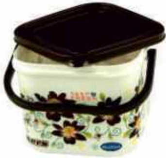
11 HANDLE PRINTED