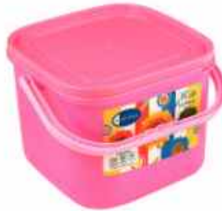
11 HANDLE OPAQUE