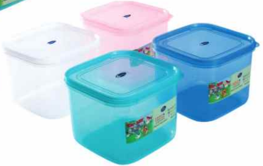
TOM & JERRY - 11