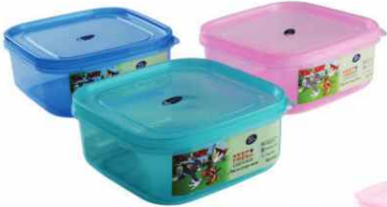
TOM & JERRY - 00