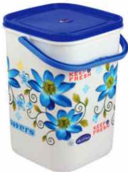
33 HANDLE PRINTED