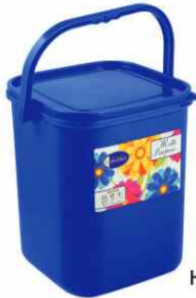
22 HANDLE OPAQUE